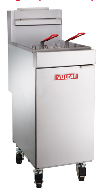
Model LG300 Shown with caster accessories